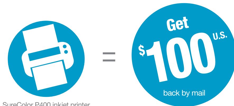
SureColor P400 inkjet printer

Purchase a SureColor® P400 or SureColor P600 inkjet printer and receive the following back by mail: