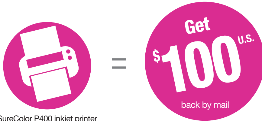
SureColor P400 inkjet printer

Purchase a SureColor ® P400 or SureColor P600 inkjet printer and receive the following back by mail: